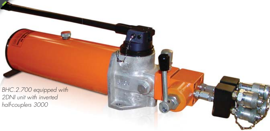
BHC.2.700 equipped with 2DNI unit with inverted half-couplers 3000