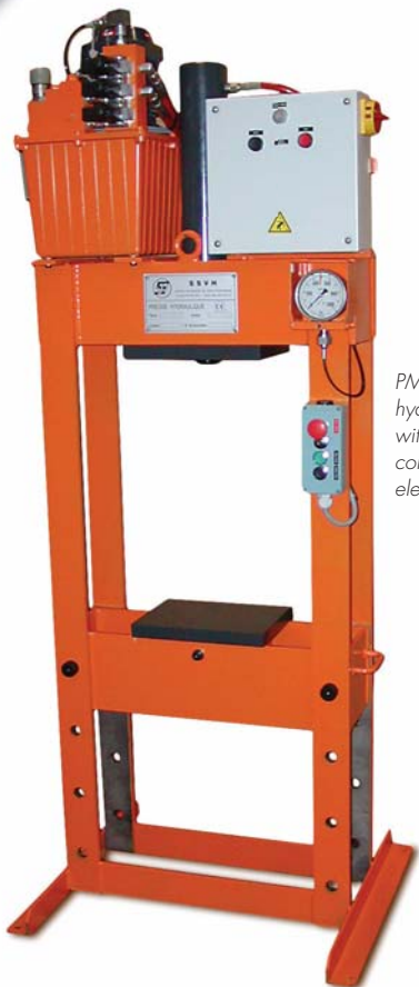
PM. 14.420 with hydraulic system with portable control box electric control

Adaptable on request, in terms of size, power, stroke or distribution, standard presses can serve as a basis for discussions on the definition of your ideal solution.