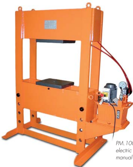
PM. 100.250 with electric system with manual control